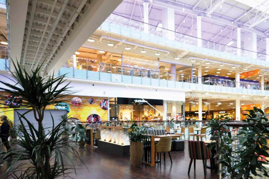
AVIAPARK SHOPPING CENTER, MOSCOW, RUSSIA

More than 15 years of experience in AIR CURTAINS manufacturing