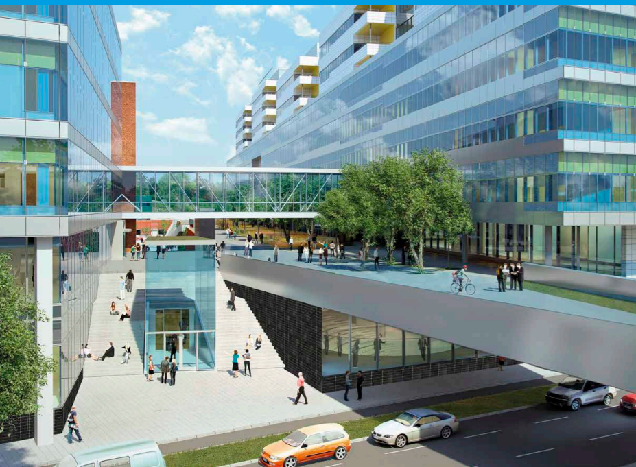
NEW KAROLINSKA SOLNA, STOCKHOLM, SWEDEN

More than 15 years of experience in AIR CURTAINS manufacturing